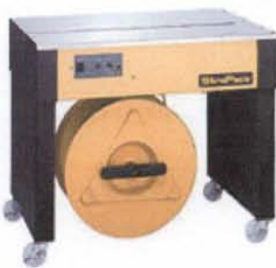
Table Top Semi-Automatic Strapping Machine

The JK-2 table top strapping machine is designed to meet industrial packaging demands economically and efficiently. With Strapack's history of producing high quality strapping machines this semi-automatic Strapack machine is sure to deliver results. This strapping machine is operator dependent for the loading and strapping process. These machines can be successfully used in a variety of industries. For maximum productivity, we recommend an automatic strapping machine such as the RQ-8A.